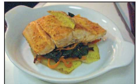
check out the new FoodWise on page 7

All the late life love issues seem to point out that what we have always heard is true—that love and marriage take work and commitment. Even if our 20-something selves still "just wanna have fun."